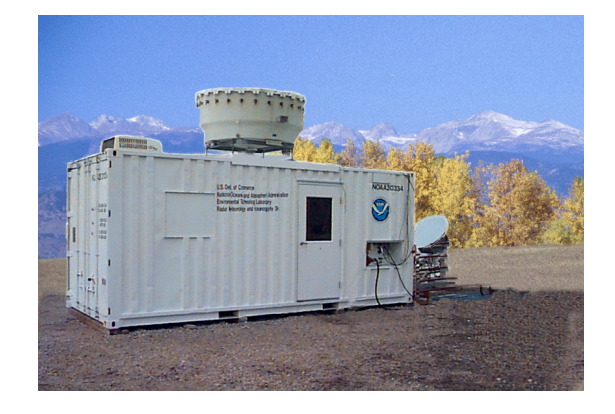
Figure 1. Photo of the MMCR Package showing the radar antenna (roof) and MWR reflector (right side).

NOAA/ETL began designing and operating dual-frequency microwave radiometers and K<sub>a</sub>-band cloud radars around 1980. More recently, it also designed the unattended cloud-profiling K<sub>a</sub>-band radars, known as the Millimeter-wave Cloud Radar (MMCR), for the U.S. Department of Energy's Cloud and Radiation Test-bed sites (Stokes and Schwartz 1994). These radars are intended to operate for at least a decade at remote locations. A nearly identical radar is also operated by NOAA/ETL for field experiments of shorter duration on land and ships. This radar is joined in the same sea container by a dual-channel microwave radiometer (MWR) and a narrow-band infrared radiometer (IRR).