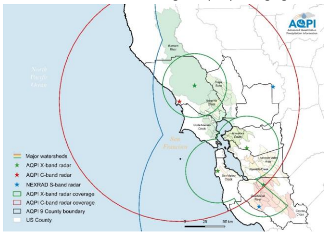
AQPI and NEXRAD radar coverages in the SF Bay Area. Small (large) circles are 40 (150) km coverage rings, and dashed circles indicate NEXRAD coverages.